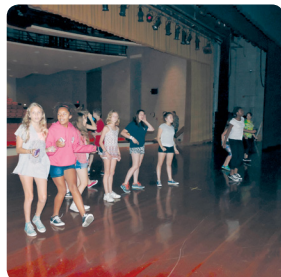
STUDIO *afternoon only*