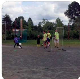
SPORTS & RECREATION

WOODWORKING – Boys & girls will learn basic carpentry skills while creating a great take home project.